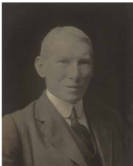
Portrait of Sir Michael O'Dwyer