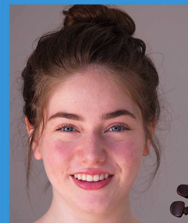
Noga Shaham (Israel)