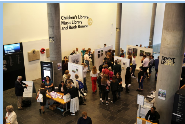
Photograph: Launch of exhibition.

An online survey was opened for the duration of the exhibition to obtain feedback from attendees. The image by Godfrey Pitt was the most frequently chosen as having the most impact. The results from the online survey are currently being collated and we will share these with you in the next newsletter.