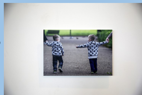
Winning image.